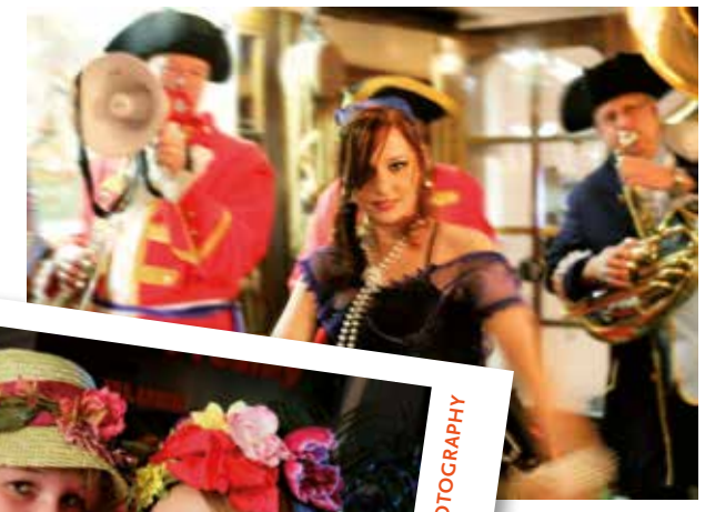
SAILORS AND PIRATES