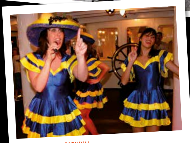
SUMMER CRUISE CARNIVAL