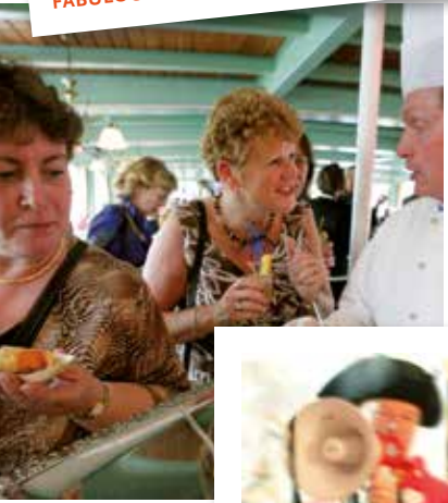
VARIOUS DAY PACKAGES