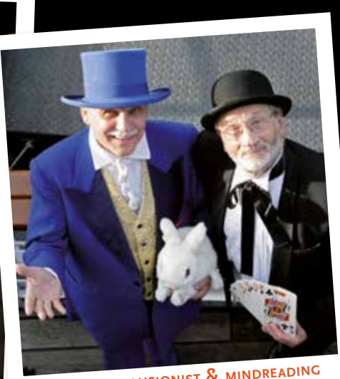
TABLE MAGIC, ILLUSIONIST & MINDREADING